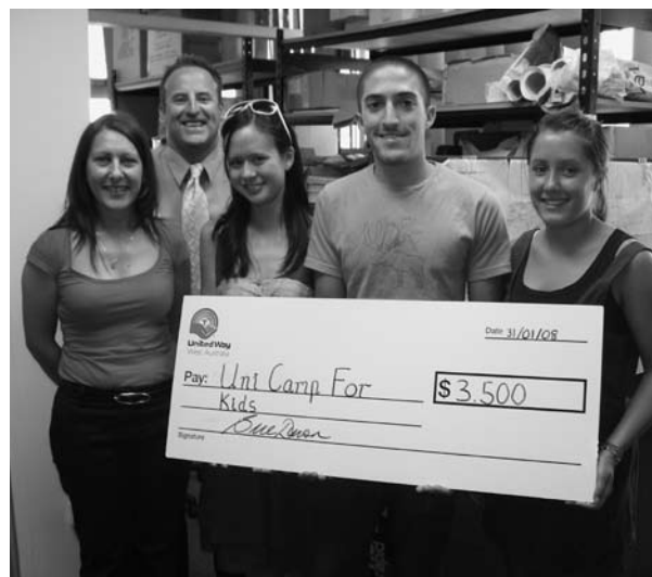
Staff from Frucor present a cheque to Uni Camp for Kids

United Way thanks Kennards Hire for the tremendous support they give United Way during Corporate Volunteering events. We have been fortunate to receive friendly helpful service and fantastic equipment to use from the Kennards staff, who are doing their bit to help their local communities.