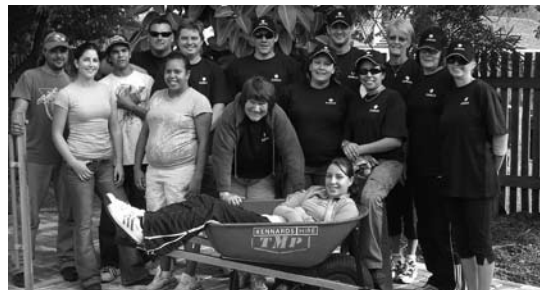
Staff from Zurich Financial Services and Balga Detached Youth Work Project celebrate after a successful (and exhausting) volunteering experience.